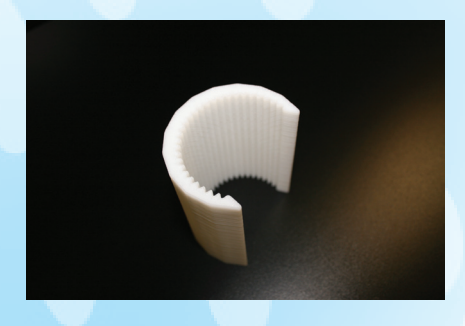
And finally make an ABS prototype.

We can also print 3D objects for prototyping purposes such as brackets, stoppers or other components that will be injection moulded when going into production.